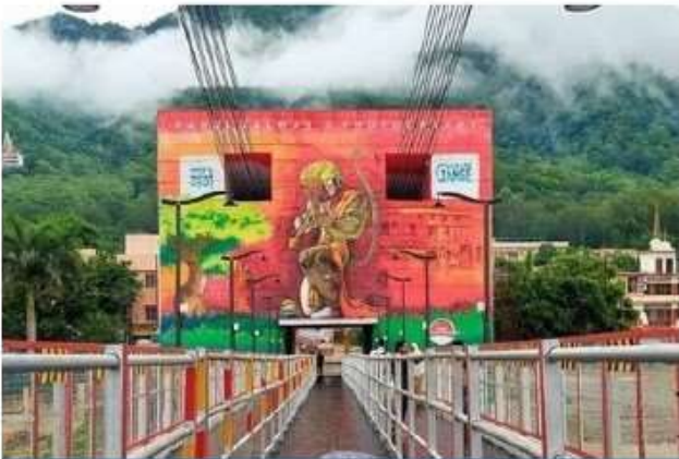
Janki Setu (6.3km)*