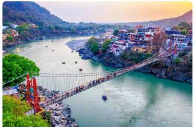
Ram Jhula (7.2km)*