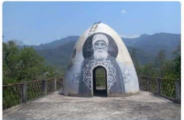
Beatles Ashram (11km)*