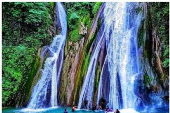
Kempty Falls (92km)*