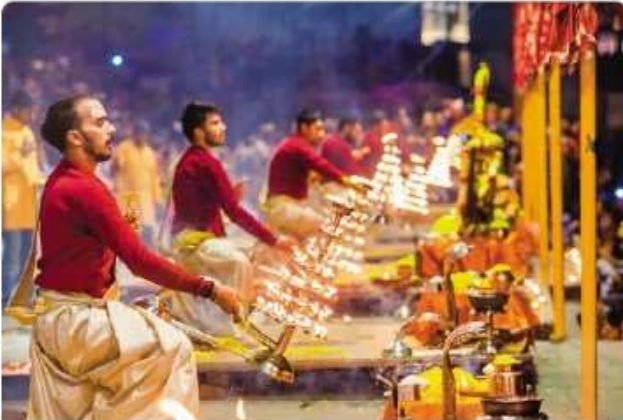
Ganga Aarti (5.1km)*