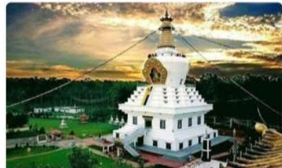
Buddha Temple (52km)*