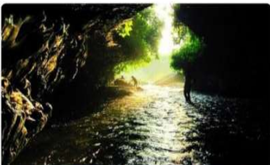
Robbers Cave (53km)*