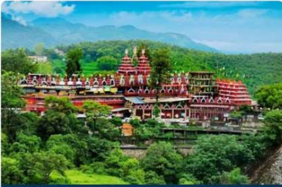
Shiv Temple (80km)*